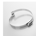
Clip-Grip Hose Clamp, screwable